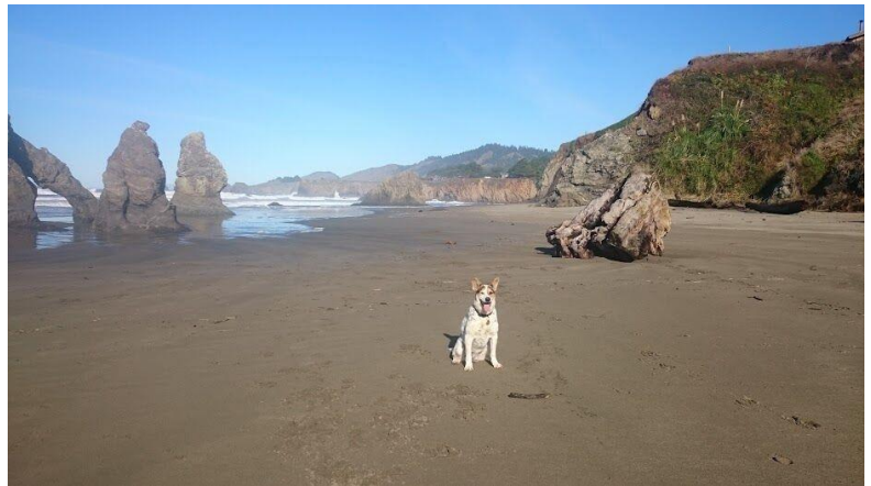
Well-behaved dogs at Seaside Beach: (photo by Monica Rua)